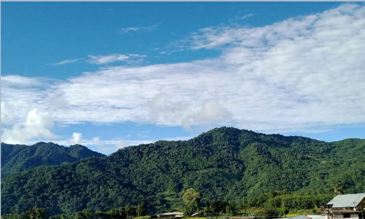
A picture of Lovii forest taken on the early morning of 25th September 2021

With the alarming increase in the world population, there is an ultimate need for more food to sustain human existence. Therefore, the step of conservation is said to have initiated by the Village Authority and later on collaborated with the Chakhesang Public Organization (CPO), which further was made recognized as a part of reserved forest in the community. Several pre planning, common interest, and individual perspective have been pondered upon the said area.