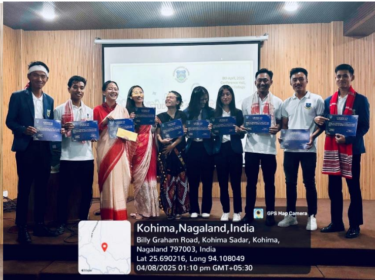
Kohima, Nagaland, India Billy Graham Road, Kohima Sadar, Kohima, Nagaland 797003, India Lat 25.690216, Long 94.108049 04/08/2025 01:10 pm GMT+05:30