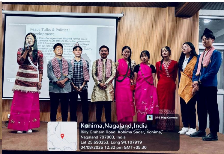
Kohima, Nagaland, India Billy Graham Road, Kohima Sadar, Kohima, Nagaland 797003, India Lat 25.690253, Long 94.107919 04/08/2025 12:32 pm GMT+05:30