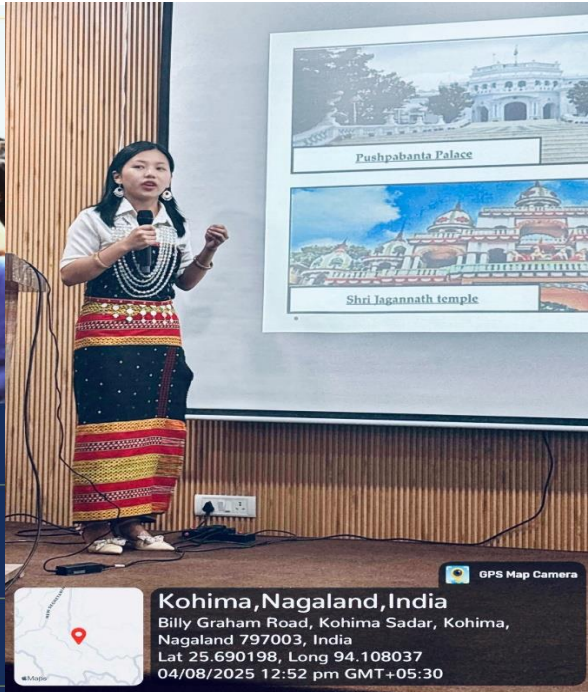
Kohima, Nagaland, India Billy Graham Road, Kohima Sadar, Kohima, Nagaland 797003, India Lat 25.690198, Long 94.108037 04/08/2025 12:52 pm GMT+05:30