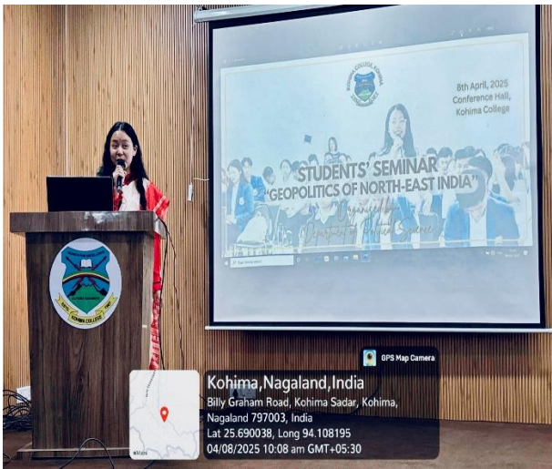
Kohima, Nagaland, India Billy Graham Road, Kohima Sadar, Kohima, Nagaland 797003, India Lat 25.690038, Long 94.108195 04/08/2025 10:08 am GMT+05:30