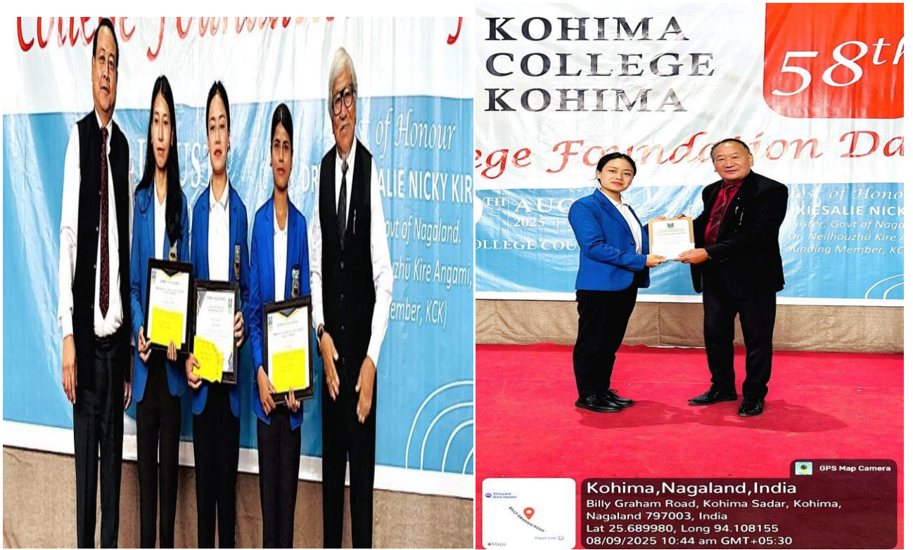
Teachers Day celebration organized by Kohima College Students Council on 5 th September 2025.